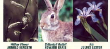
Willow Flower ARNOLD KENSETH TRAIL Cottontail Rabbit HOWARD GARIS TRAIL Iris JULIUS LESTER TRAIL