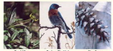
Tread Lily EMILY DICKINSON TRAIL Eastern Bluebird ROBERT FROST TRAIL Pine Cone EUGENE FIELD TRAIL

--- LITERARY TRAILS --- OTHER TOWN OF AMHERST CONSERVATION TRAILS --- NEW ENGLAND CENTRAL RAILROAD - - - - NEW ENGLAND CENTRAL RAILROAD